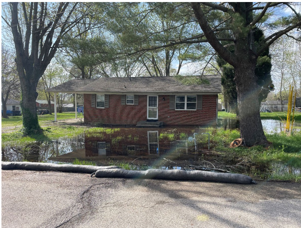
Exhibit A, pg. 5